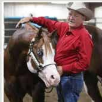
Cole Show Horses